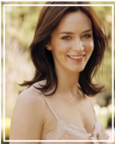
Starring Emily Blunt ( The Devil Wears Prada, Edge of Tomorrow )

Questions? Comments? Please contact us at info@gedneyfarms.net .